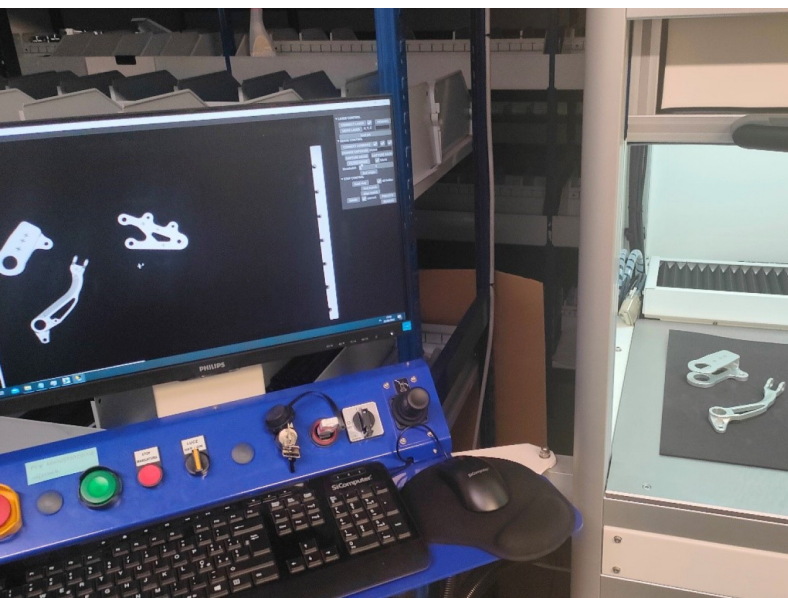
Fig. 3: Use setup of the machine controlled by the MUSP software