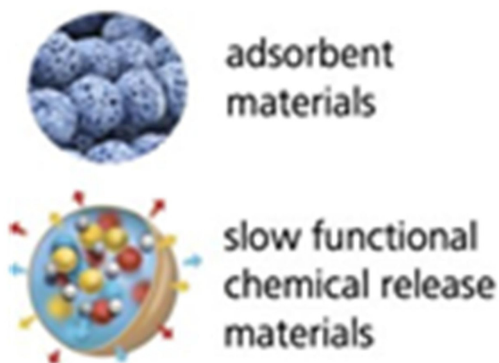
Fig. 2: Functionalized advanced chars: structure and applications.