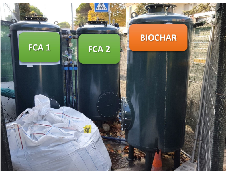
Fig. 3: Application of biochar for water remediation in a Pump & Treat plant