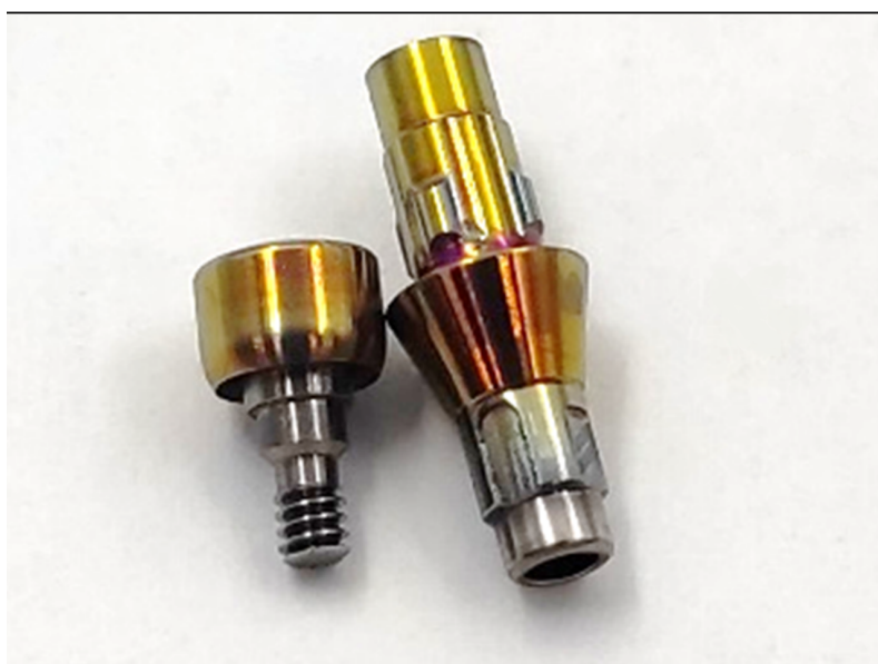
Fig. 1: YSZ coating on abutments