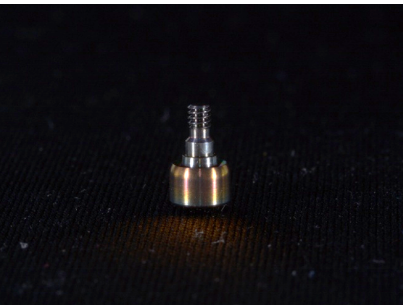
Fig. 2: YSZ coating on healing abutment