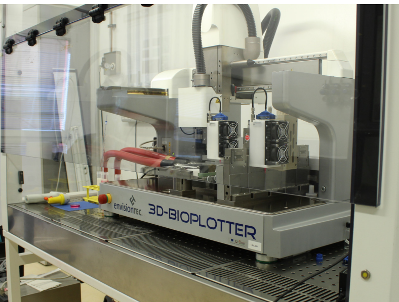
Fig. 2: EnvionTec 3D Bioplotter, an instrument used for in vivo modelling