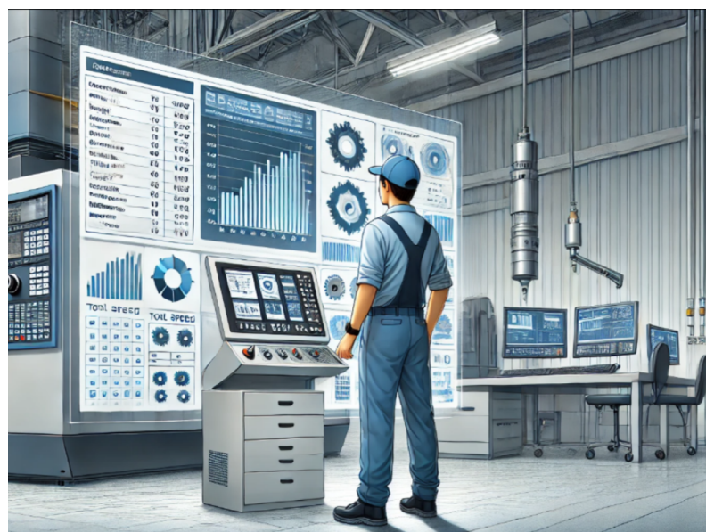
Fig. 1: eXpert Knowledge formalization for a human-centered manufacturing